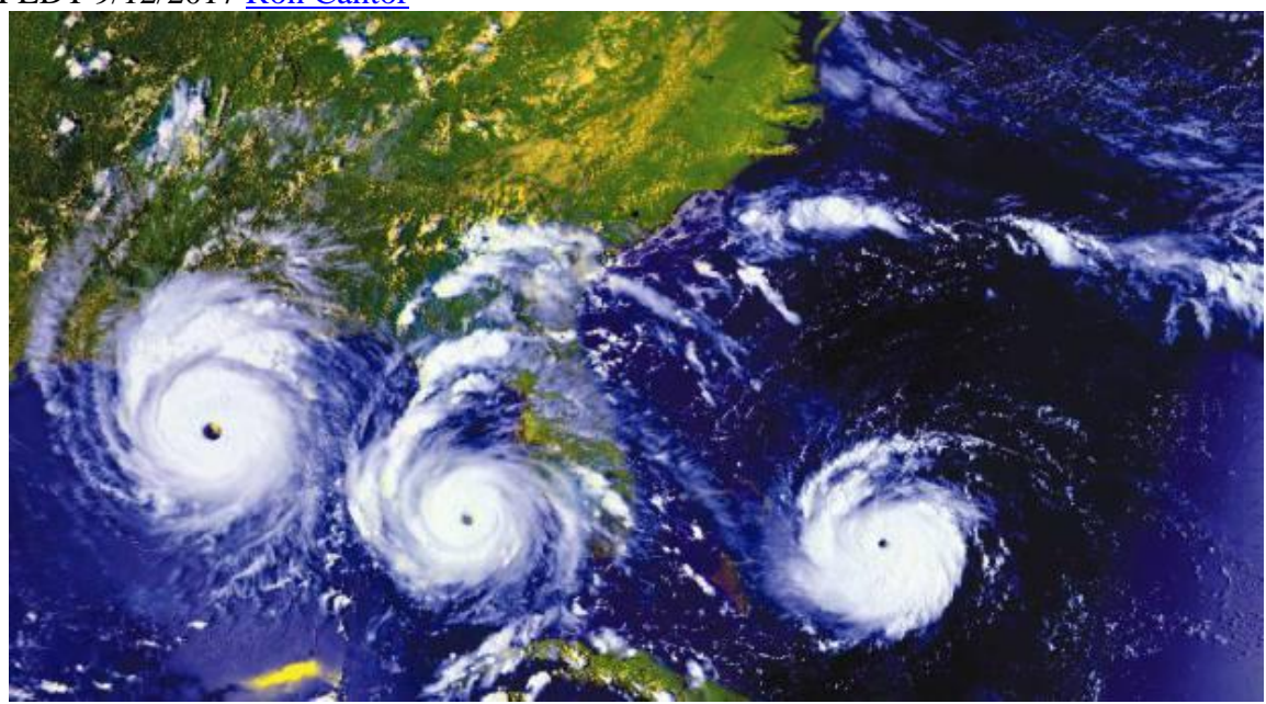
Satellite image of hurricanes

One of my mentors often says he does not like armchair prophets. An armchair prophet is somebody who prophesies after the fact. What do I mean? It's too easy to say after a tragedy that it was judgment from God. You're far more credible if you prophesied before the tragedy that a judgement is coming if a certain country doesn't do X, Y or Z.